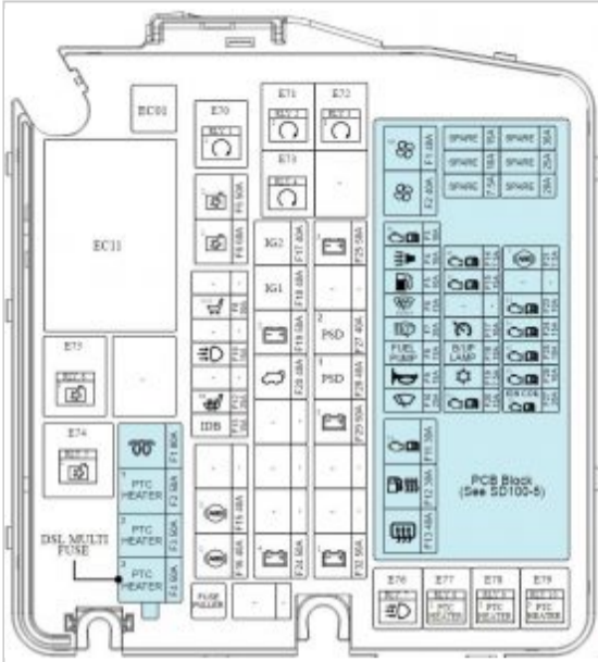
KIA Carnival YP – fuse box diagram – engine compartment